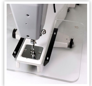
OPTIONAL 15" RULER BASE