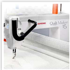
15" OF FREE-MOTION FREEDOM