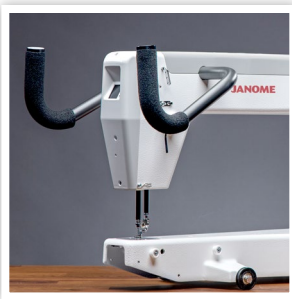
ERGONOMIC FRONT HANDLEBARS