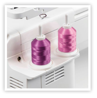
DUAL THREAD STAND