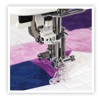
SUPERIOR NEEDLE THREADER 2