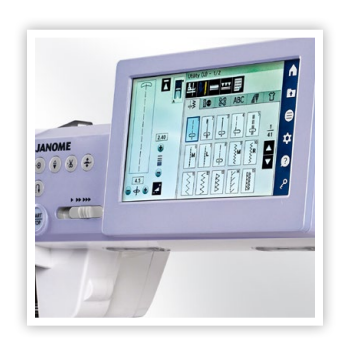
7" TOUCH SCREEN AND STYLUS