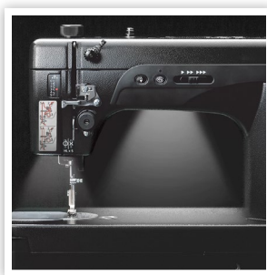
BRIGHT LED LIGHTING, TWO LOCATIONS