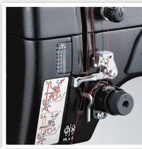
ADJUSTABLE THREAD GUIDE