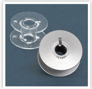
HIGHER CAPACITY BOBBIN (1.4X LARGER)