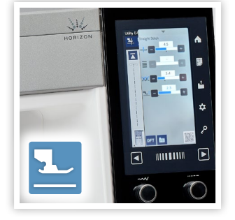
FLOATING MODE FOR TRICKY FABRIC