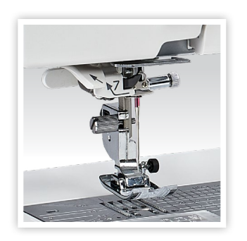
ENHANCED FEED DOG AND NEEDLE THREADER