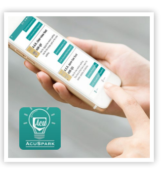
ACUSPARK2 APP LEARNING AND SUPPORT