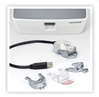
A.S.R. (ACCURATE STITCH REGULATOR) COMPATIBLE*