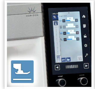
FLOATING MODE FOR TRICKY FABRIC