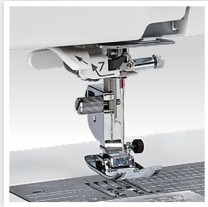
ENHANCED FEED DOG AND NEEDLE THREADER