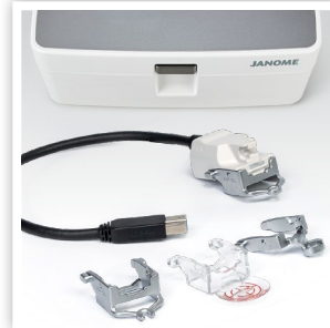
A.S.R. (ACCURATE STITCH REGULATOR) COMPATIBLE*