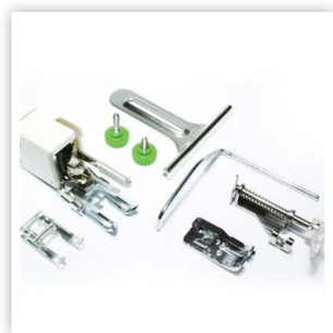
QUILTING KIT INCLUDED