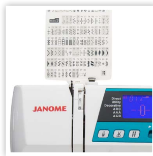
DETACHABLE STITCH CHART