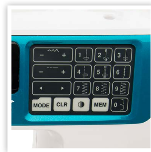
MANY CONVENIENT FEATURES