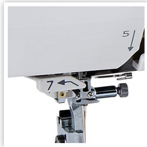
SUPERIOR NEEDLE THREADER WITH THREAD GUIDE 7