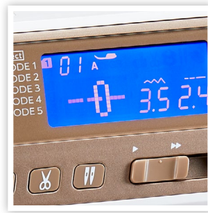
ENHANCED LCD SCREEN DISPLAY