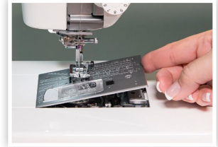
ONE-STEP NEEDLE PLATE CONVERSION