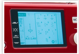
3.6" LCD SCREEN