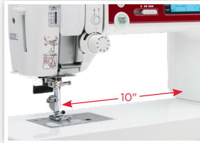
10" WORK SPACE, SEAMLESS METAL FLATBED