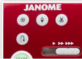
AUTOMATIC THREAD CUTTER