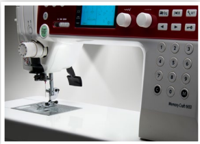
STREAMLINED SHAPE AND ENHANCED LIGHTING