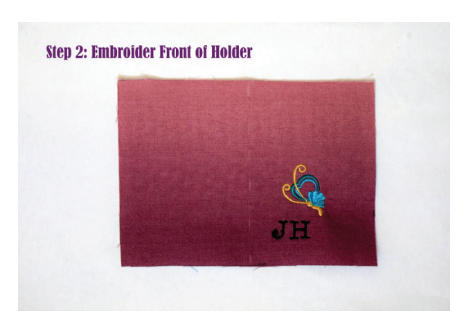
Step 2: Embroider your front piece. Fold your front piece in half and lightly mark the piece in half. This will show you roughly how much of the front piece will show in the front of the wallet. You will only be able to fit a small amount of embroidery, but have fun with it! I used small lettering and a small butterfly design built into my machine. There will be a button sewn onto the front, so keep that in mind when designing your front.